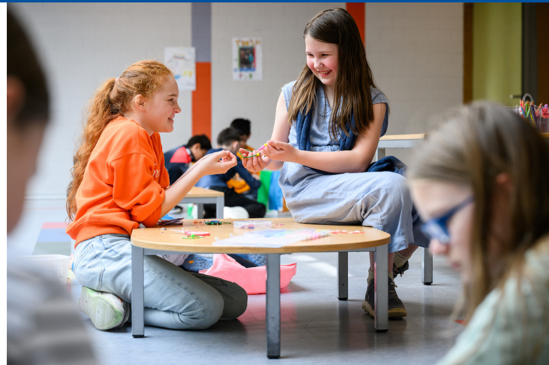
Breakout Seating Areas for Primary & Secondary School

Contribute to the realization of these two projects!